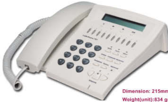
Dimension: 215mm(W) x 71mm(H) x 198mm(D) Weight(unit):834 grams